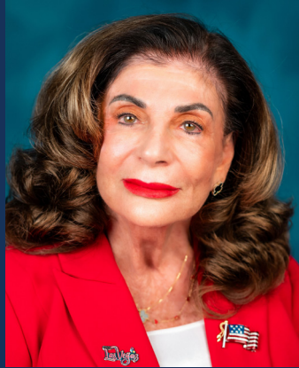
SHELLEY BERKLEY City of Las Vegas